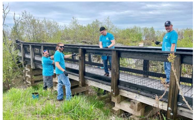
Above: Serve with Liberty volunteers staining accessible boardwalks on the Big A Trail.